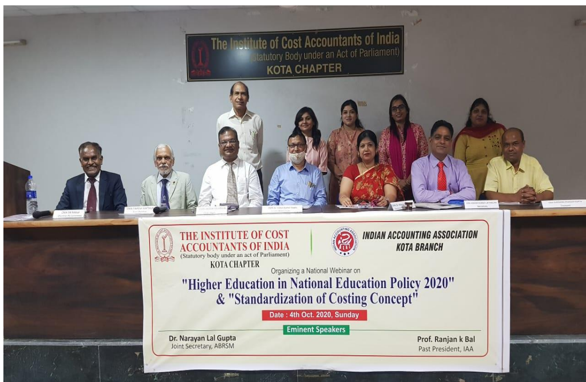
Organizers and Organizing Team