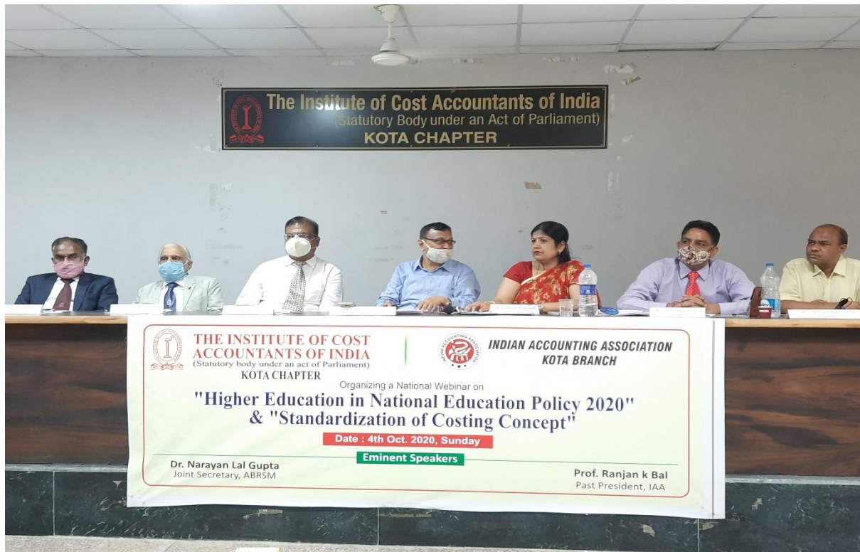
Members at the Dice