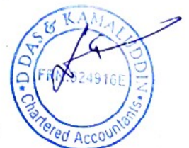
Treasurer - IAA